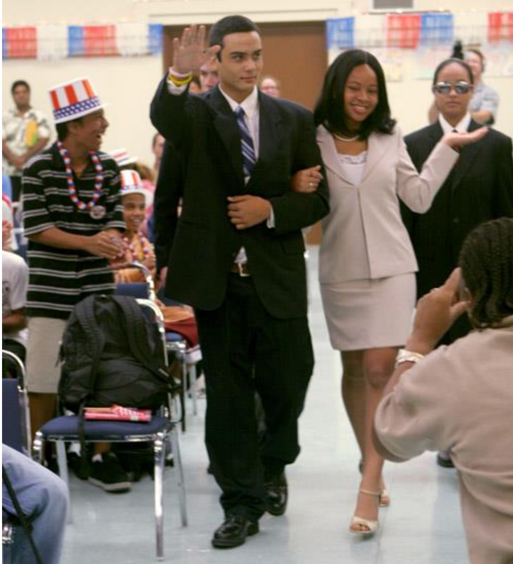
Kwajalein High School, Marshall Islands, South Pacific