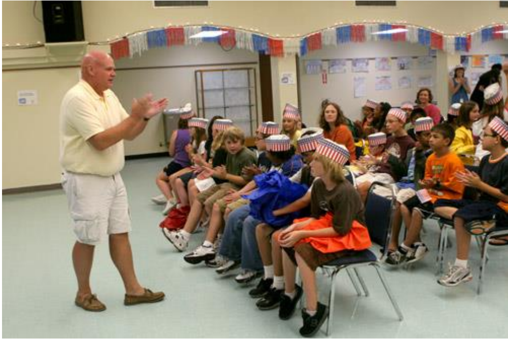
Kwajalein High School, Marshall Islands, South Pacific