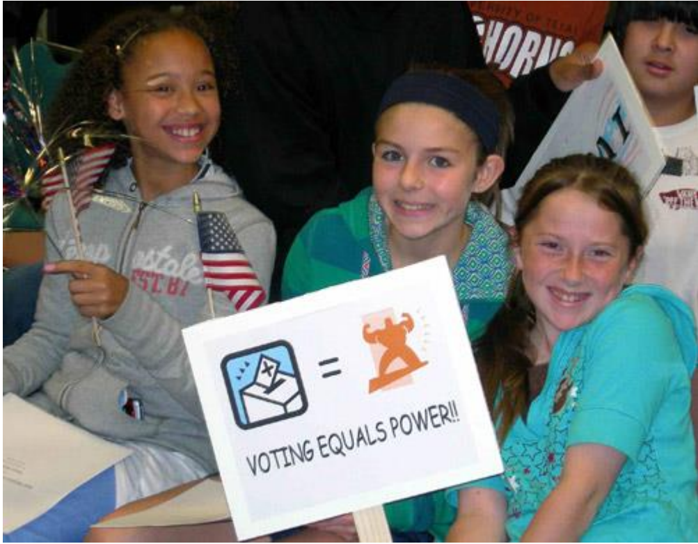
League of Women Voters Oregon