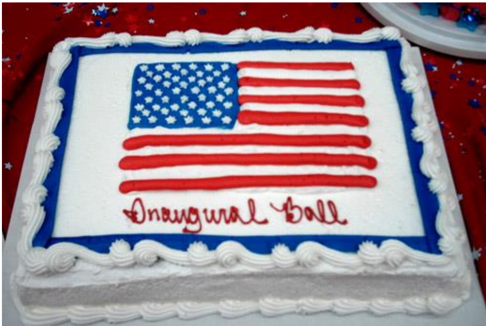
Desert Heights Inaugural Ball