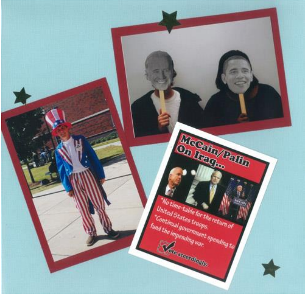
Spain Park High School, Hoover, Alabama