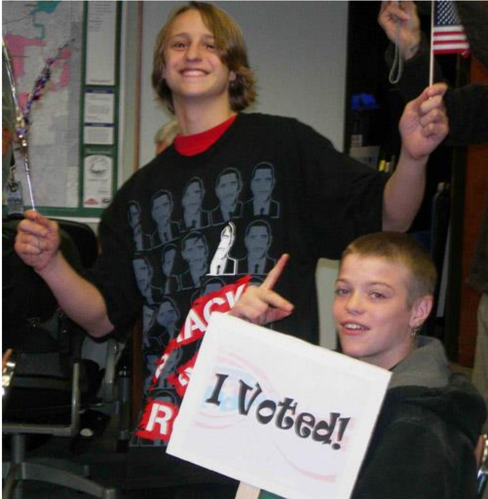
League of Women Voters Oregon