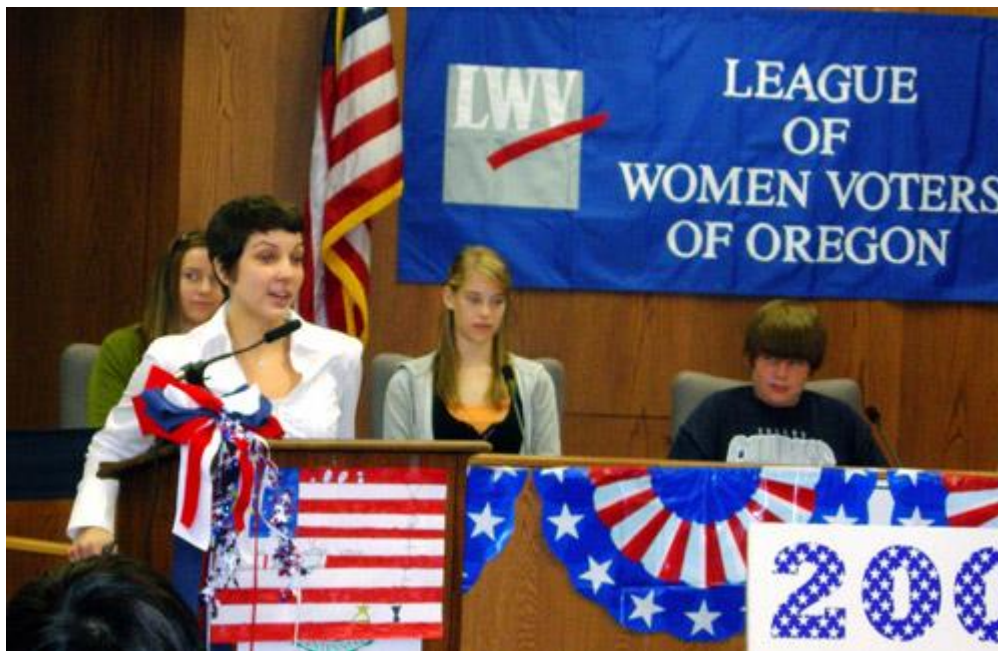
League of Women Voters Oregon