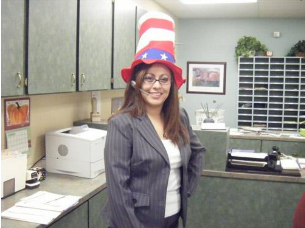
Desert Heights Elementary School, Reno, Nevada