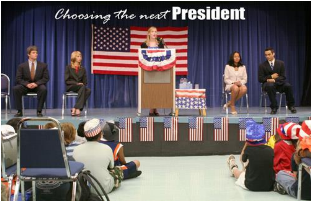
Kwajalein High School, Marshall Islands, South Pacific